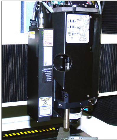
TeleStar Plus TTL Laser integrated on a SmartScope® Vantage™.