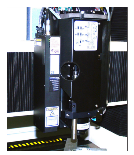
TeleStar Plus TTL Laser integrated on a SmartScope<sup>®</sup> Vantage<sup>™</sup>.